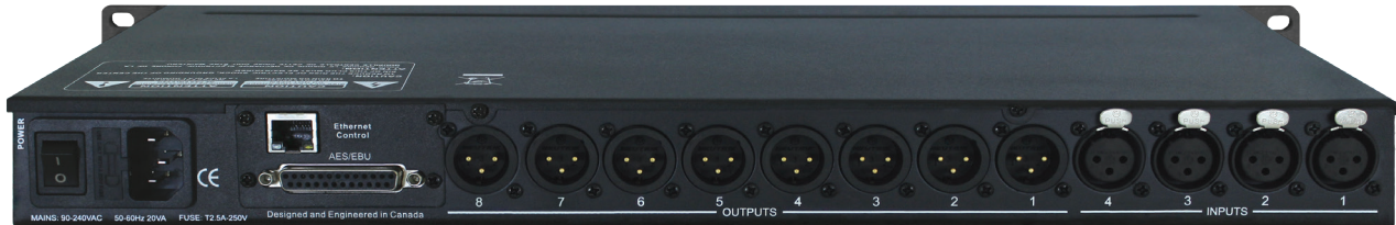
Above: Rear panel view of the XD-4080, with XLR I/O section.